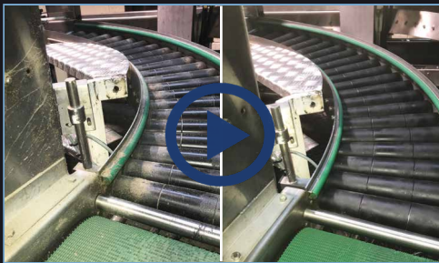
WATCH OUR VIDEO TO SEE SOME PRE-AUDIT CLEANING PROJECTS WE HAVE UNDERTAKEN

Ideal for Pre-Audit Deep Cleaning, the process effectively decontaminates surfaces with food-grade (BRC) Dry Ice. It provides a superior quality clean, leaving equipment in pristine condition.