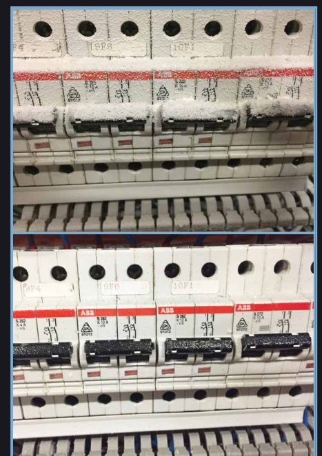
DISTRIBUTION BOARD BEFORE AND AFTER DRY ICE CLEANING

For more about Dry Ice Cleaning www.polaricetech.ie