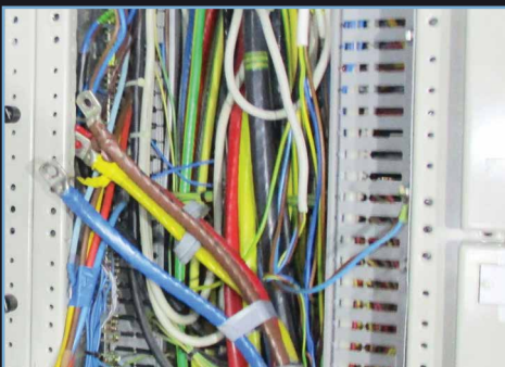
PREVENTATIVE MAINTENANCE CLEANING ENSURES RELIABILITY AND PERFORMANCE

Regular cleaning of electrical distribution boards, cabinets and components ensures the reliability and performance of the equipment and prevents issues such as this from arising.