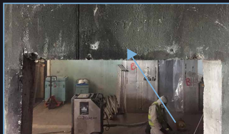
SIGNIFICANT SMOKE CONTAMINATION ON A DOORWAY BEFORE DRY ICE CLEANING