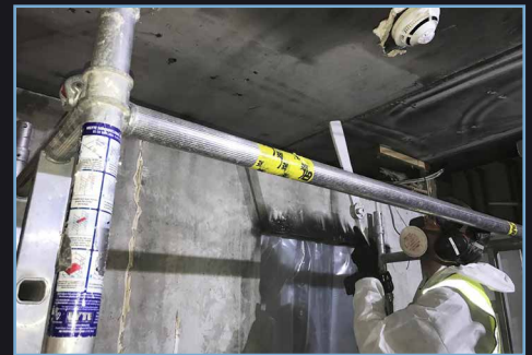
DRY ICE CLEANING DECONTAMINATES AND PRODUCES A SUPERIOR QUALITY CLEAN

For more about Dry Ice Cleaning www.polaricetech.ie